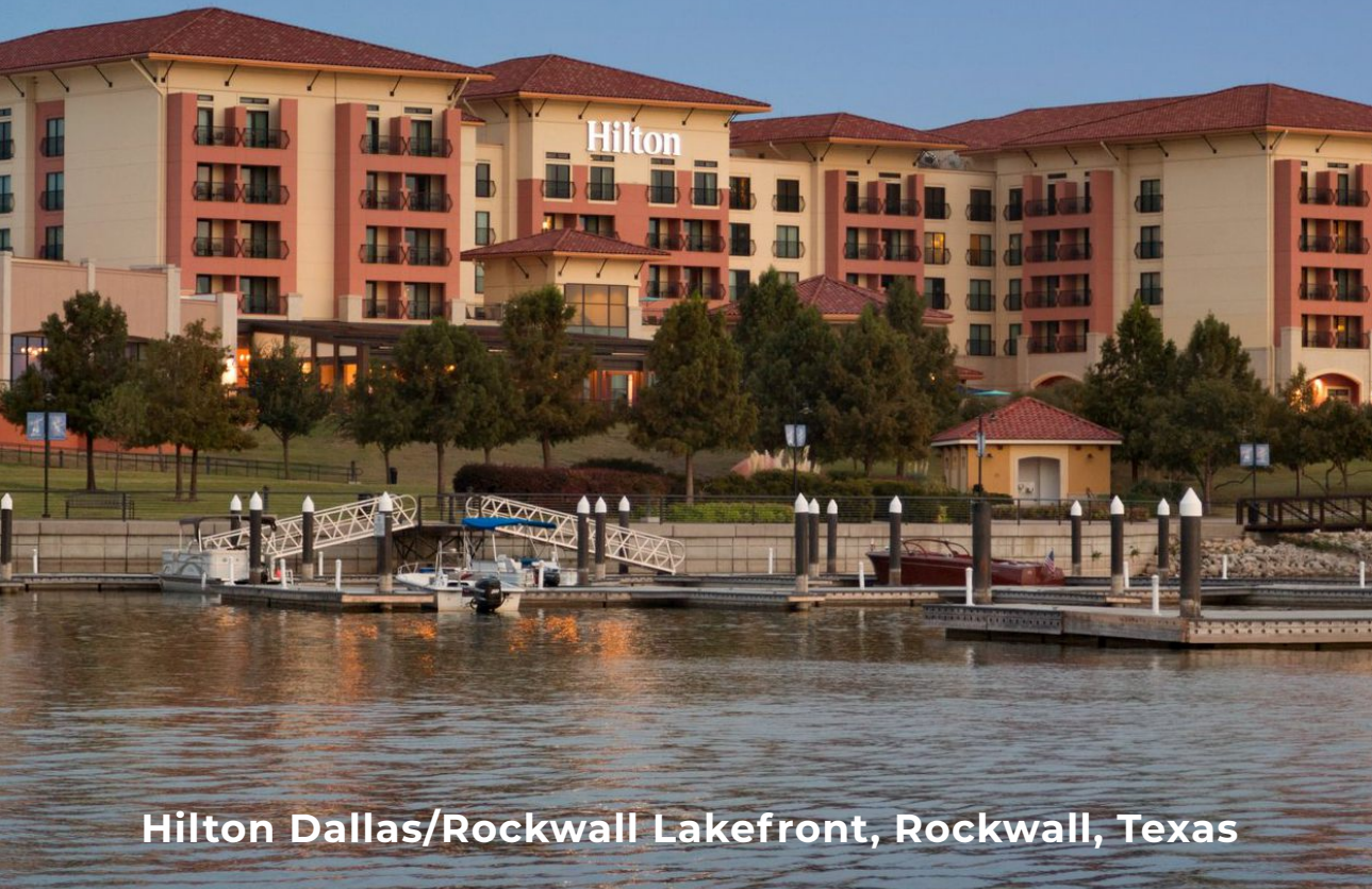
Hilton Dallas/Rockwall Lakefront, Rockwall, Texas